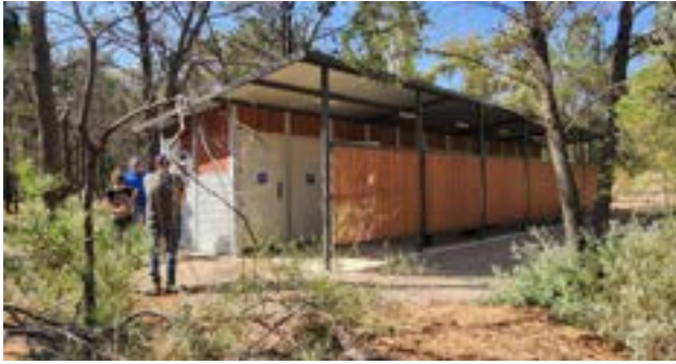
TOILET AND SHOWER BLOCK AT THE GROUP CAMP