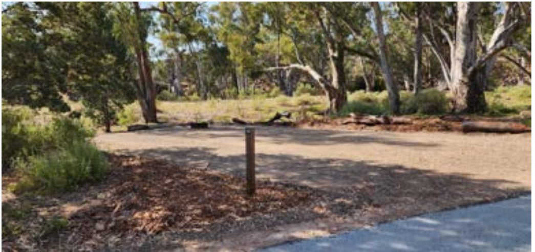
LARGE FLAT CAMPSITES, SOME WITH PLENTY OF SHADE

THE WORKS HAVE MODERNISED THE CAMPGROUND, WHICH WAS BUILT IN THE 1980S, WHILE KEEPING THE FEEL AND EXPERIENCE OF THE OUTDOORS. CAMPERS AND CARAVANERS HAVE ACCESS TO 49 CAMPING SITES, INCLUDING 11 DOUBLE SITES AND 4 DRIVE-THROUGH SITES, WITHIN THE MAIN CAMPGROUND. UPGRADES INCLUDE: