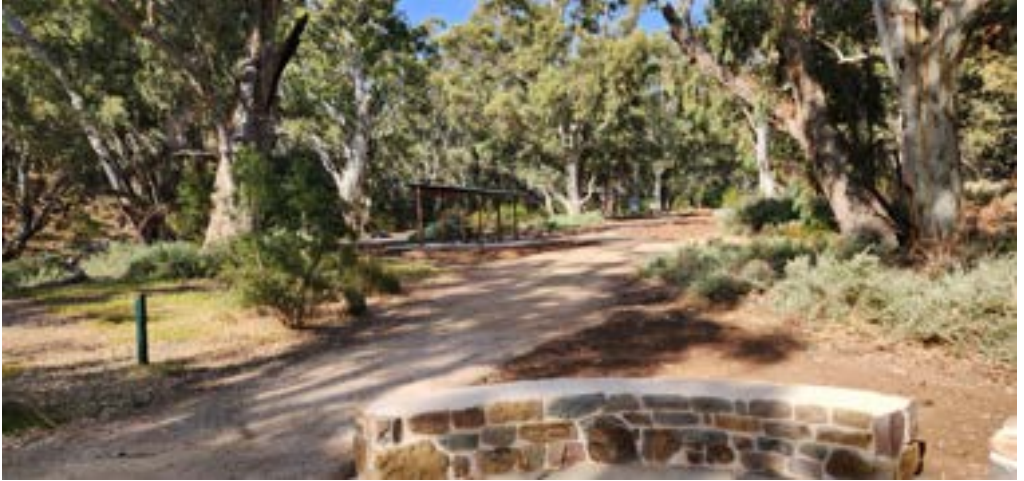
PICNIC SHELTERS AT THE DAY VISITOR AREA

MORE SPACIOUS SITES ALLOW CAMPERS EXTRA PRIVACY TO RESPONSIBLY KICK BACK WITH A BEER OR A GLASS OF WINE AND ENJOY THEMSELVES IN THEIR BEAUTIFUL SURROUNDINGS.